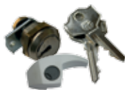
Cylindre DIN avec cryptage variable e levier de déverrouillage