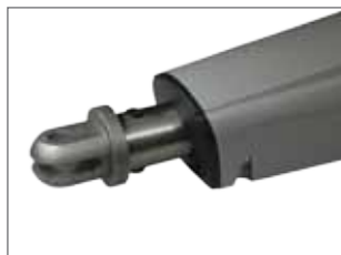
Adjustable front fixing plate to screw or weld