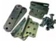
Adjustable back fixing bracket no welding (2 pcs)