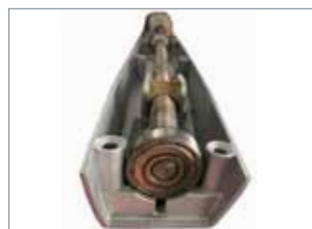
Strong metal gear drive supported by bearings for max resistance