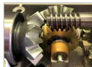
Metal gears with bearings

Strong endless screw supported by bearings for max. resistance, and steel rod with front fixing and nylon bush