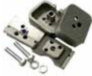
Mechanical stops (2 pcs)