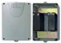
Battery kit with box