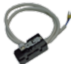
Safety microswitch kit on the door