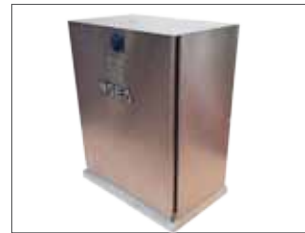
Cover in stainless steel