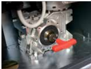
Mechanical limit switch with lever