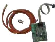
PROBE Kit to manage low temperature + LE unit + 1,8 m cable