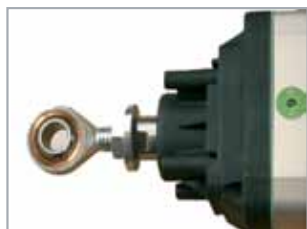
Round joint for stroke adjustment