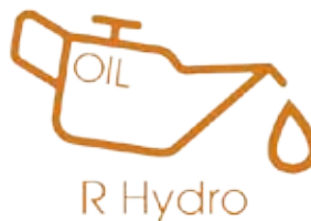
On request versions with hydraulic slowdown