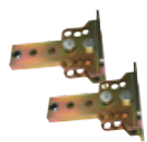
Adjustable rear bracket to screw 2 pcs