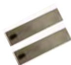
Bracket for outwards opening L 400 mm - (2 pcs)