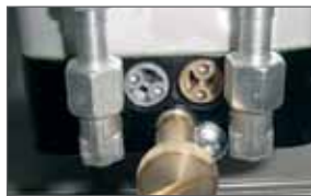
By pass valves for the force adjustment