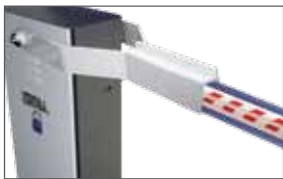
Double fork coupling for oval beam