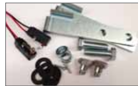
Mechanical and electronic limit switches