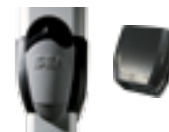
HTLOCKP Metal release PLUS with DIN lock for max. safety and joint