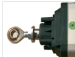
Round joint for stroke adjustment