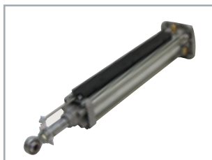
POSITION GATE Absolute Linear Encoder (optional)