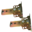
Adjustable back bracket to screw 2 pcs