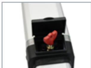
Release system with SEA personalized key