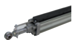
POSITION GATE * KIT Absolute linear encoder with extrusion