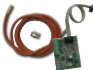
Kit Probe to manage low temperature + card LE + cable 1.8 m