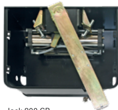
Jack 800 CP