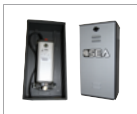
Galvanized steel and polyester painted box (included)