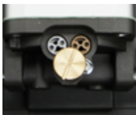
Strength control valves