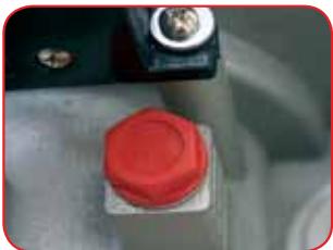
Gearmotor in oil bath