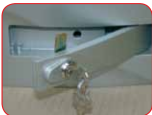
Manual release with key