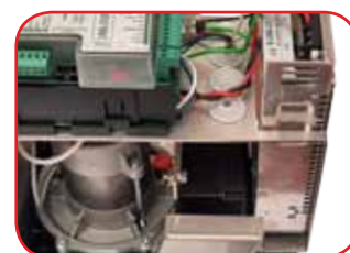
Absolute Encoder POSITION GATE RT