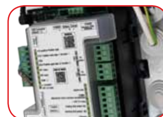
Control unit UNIGATE BR