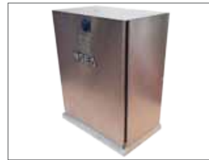
Stainless steel cover