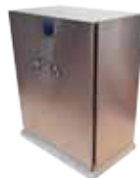
Stainless steel cover (option)