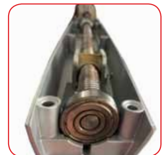
Screw with ball bearing