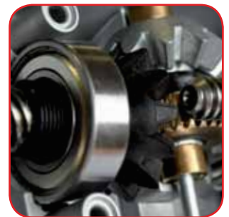
Metal gear drive with reinforced screw supported by ball bearings for maximum strength.