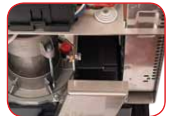
Absolute Encoder POSITION GATE RT