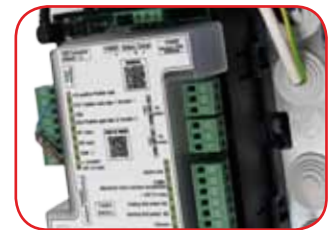
Control unit UNIGATE BR