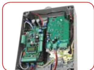
Control board UNIGATE BR to manage brushless operators