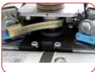
Mechanical and electronic limit switches IP67