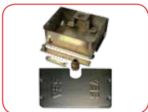
Carrying box in stainless steel