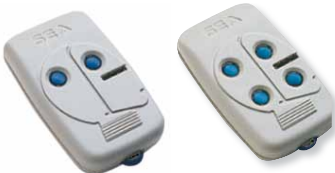
Head 2 channels 433MHz / Head 2 canali 433Mhz

18 MILLIONS OF COMBINATIONS 18 MILIONI COMBINAZIONI